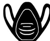
Protective Clothing Pictograms