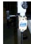
Safety Power Disconnect Switch