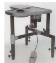
Brent Leg Extension Kit