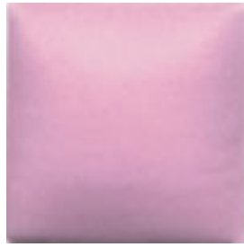
NEW! SN 369 Wisteria