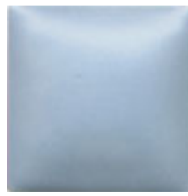
NEW! SN 370 Ice Blue