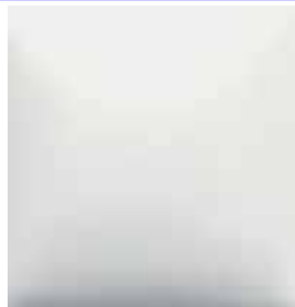
SN 352 White