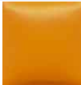
SN 355 Orange Fizz