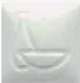
SN 351 Clear