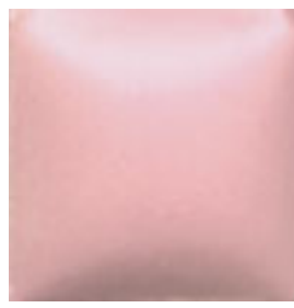
NEW! SN 368 Rose Petal