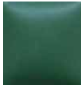
SN 361 Christmas Green