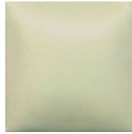
NEW! SN 371 Key Lime