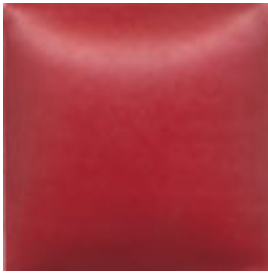
NEW! SN 372 Red Velvet