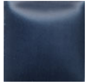
NEW! SN 373 Midnight Blue