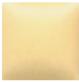
NEW! SN 367 Banana Cream