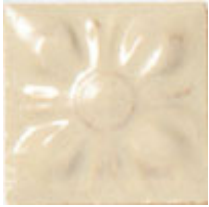
New DG 210 Cashmere Creme