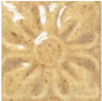
DG 204 Natural Linen