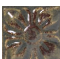
DG 209 Teal Tweed