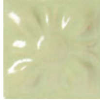
New DG 212 Celery Charmeuse