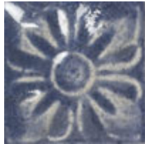
DG 201 Distressed Denim