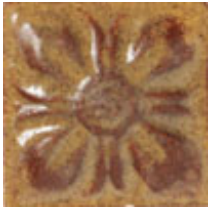
New DG 214 Sienna Suede