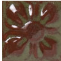
DG 206 Forest Flannel