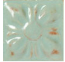
New DG 213 Seafoam Sateen