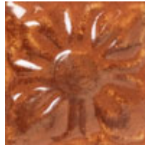
DG 202 Organza Orange