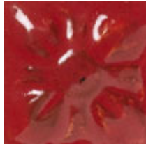
DG 205 Crimson Chenille