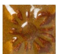
DG 207 Saffron Silk