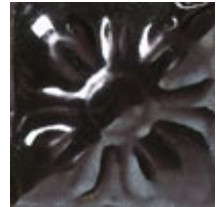
DG 203 Carbon Chiffon