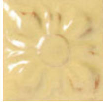
New DG 211 Maize Twill